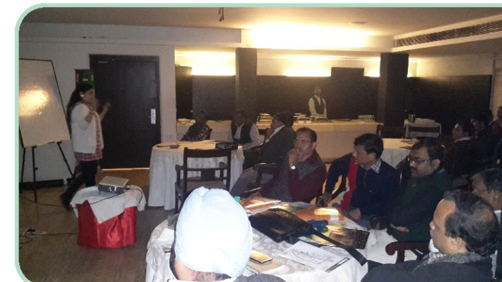
Airwill- 15 years old real estate company shake hands with Panace Quick Bricks as an exclusive channel partner for allahabad. An HNI associate meet has been done on 6th February in Hotel Milan Palace.